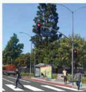
MLK and Hoover